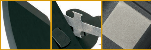
Strong 3,6 Bowie blade