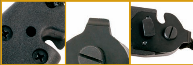
Water drainage hole